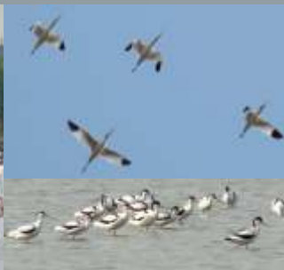
Pied Avocets (above) in flight, and on the water surface (below)