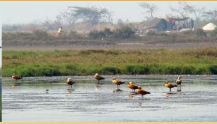
Wintering Ruddy Shelduck at Uran

Ducks arriving in several hundreds each season at this haven included Northern Shoveller Anas clypeata , Garganey Anas querquedula , Gadwall Anas strepera and Ruddy Shelduck Tadorna ferruginea . The Spot-billed Duck Anas poecilorhyncha and Lesser Whistling Duck Dendrocygna javanica were also seen. Storks were one of the major attractions at Uran with a large resident population of Painted Stork to mesmerize you, and also the lovely Asian Openbill Anastomus oscitans to add to the company. Many others have also sighted the rare migrant Oriental White-stork Ciconia boyciana here, however in spite of numerous attempts I was never fortunate enough to catch a glimpse of them.