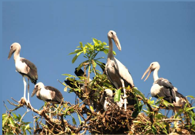
Nesting flock of Asian Openbill on a tree in Adina PF

select nesting trees. By the first week of July, the whole group assembles and nest building activity commences. Competition for selection of nesting trees and nest building is high in this small heronry. Individuals which are unable to get suitable trees for nesting do so on trees along the agricultural fields and sometimes on trees in the backyard of adjacent human settlements, outside the protected area. Sometimes Asian Openbills build their nests in close proximity of other water birds. During incubation period, egg lifting was found to be a common feature, by Large-billed Crows Corvus macrorhynchos . Another common but beautiful sight was the parents protecting their chicks from the scorching sun by spreading their wings over them. In October, parents start training their juveniles to fly. During this phase, a large number of juveniles fall down from the nest and are killed by stray dogs, jackals, jungle cats and monitor lizards. By the end of December most of the chicks have fledged and birds start leaving the forest.