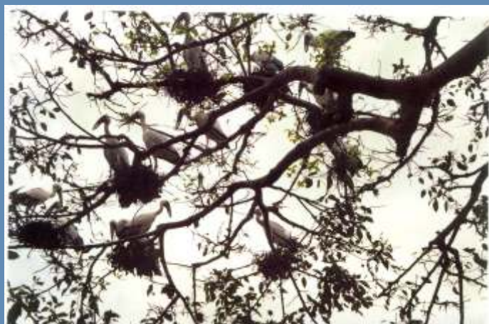
A single branch of a tree holding several nests of Asian Openbill

The birds might have become habituated to human disturbances. This site-fidelity in the Asian Openbill could be investigated further. A good reason for the site-fidelity might be abundance of food. The area being dotted with many large water bodies, riverine beds and marshy areas, has an abundant population of the Apple Snail. This small heronry regularly supports 4-6% of the existing population of Asian Openbill of South Asia, making it worthy of being designated as an Important Bird Area of India under the Category A4(I).