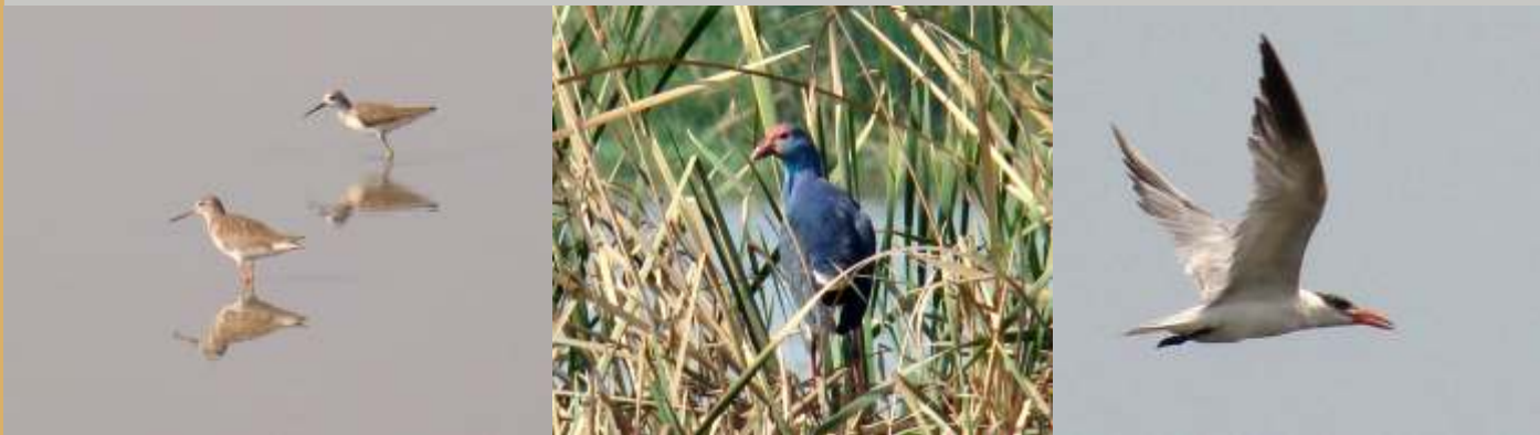
L-R: Sighting of Common Redshank Tringa totanus and Marsh Sandpiper Tringa stagnatilis , Purple Swamphen Porphyrio poliocephalus and Caspian Tern (one of the largest terns found in India) was common in the wetland

Ducks arriving in several hundreds each season at this haven included Northern Shoveller Anas clypeata , Garganey Anas querquedula , Gadwall Anas strepera and Ruddy Shelduck Tadorna ferruginea . The Spot-billed Duck Anas poecilorhyncha and Lesser Whistling Duck Dendrocygna javanica were also seen. Storks were one of the major attractions at Uran with a large resident population of Painted Stork to mesmerize you, and also the lovely Asian Openbill Anastomus oscitans to add to the company. Many others have also sighted the rare migrant Oriental White-stork Ciconia boyciana here, however in spite of numerous attempts I was never fortunate enough to catch a glimpse of them.