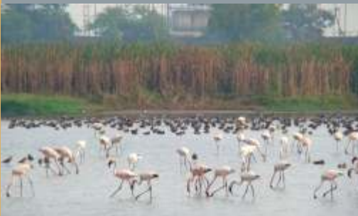
Lesser Flamingos feeding alongside waders and ducks