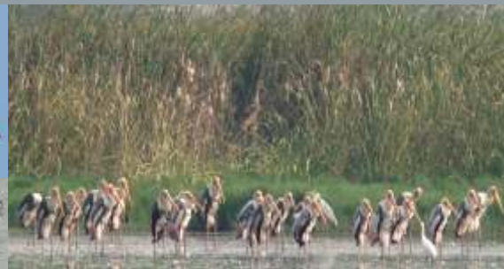
Painted Storks, one of the Near Threatened species, seem to have lost another habitat

Lesser Flamingos Phoeniconaias minor though seen in these wetlands, were definitely not many in numbers as compared to the Greater. Pied Avocets Recurvirostra avosetta are unique shorebirds having upcurved slender bills with which they sweep the marshes from side to side to collect food. This action resembles that of a hockey-stick being plied during a game; hence they came to be called hockey-stick birds. I have seen large number of Pied Avocets on almost every visit to the wetland. While watching their flight from below, one cannot miss the resemblance to military aircraft in flight. Eurasian Spoonbills Platalea leucorodia were another special species encountered here. I had on several occasions seen almost 80-100 of them assembled in a close packed flock. Individually they could be seen mingling with flocks of Painted Stork Mycteria leucocephala and occasionally with Grey Heron Ardea cinerea and Purple Heron Ardea purpurea too.