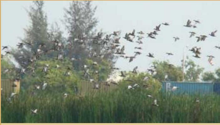
A flock of Garganey in flight