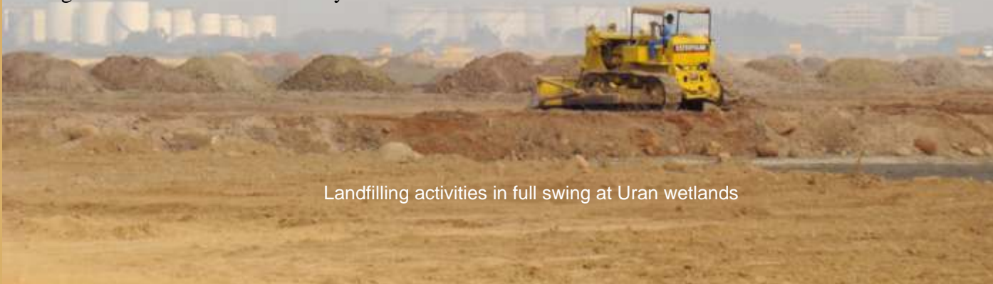
Landfilling activities in full swing at Uran wetlands

This account of my experiences gives an idea of the rich avian biodiversity that the area held. Almost all of this is gone now. The present state of these wetlands portrays a very sad picture, since a vast expanse of this paradise has now been land-filled for developmental activities. Now the area has undergone such a drastic change that it does not even remotely resemble the once-bountiful wetland it was.