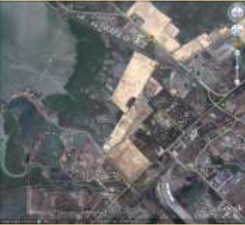
Large tracts of the wetlands have been land-filled in Uran