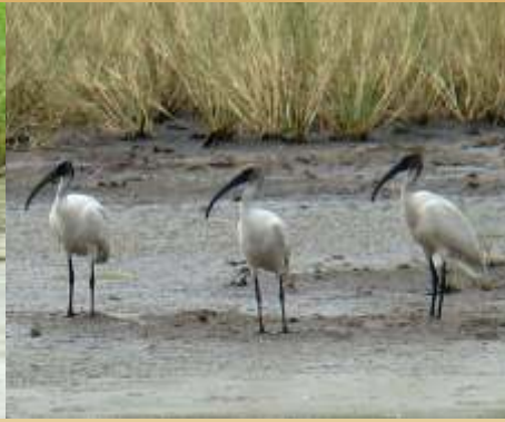
Black-headed Ibis, a Vulnerable species, used to be regular visitors to the wetlands