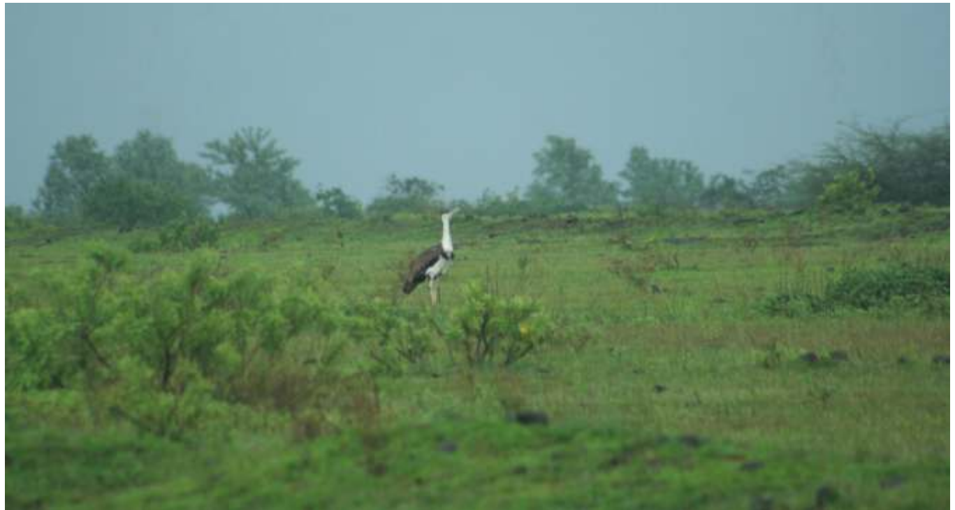
Conservationists believe that the denotification of the Great Indian Bustard Sanctuary will help in efficient implementation of conservation measures for the Great Indian Bustard Ardeotis nigriceps by concentrating attention on the reduced area

The sanctuary has been reduced from 8494 sq. km to 1222 sq. km. According to Praveen Pardesi, Principal Secretary (Forests), Maharashtra, with total staff of 60 personnel it was impossible to monitor such a large area, which included developed townships. Now the government can focus on core areas and improve conservation efforts. However, the government will have to acquire private lands to make continuous patches available for breeding of the bird. A budget of Rs 10 crore has been set aside to acquire 434 hectares in the core area of Nannaj Mardi, officials said. Core areas imply lands owned by the forest and revenue departments that can be given strict protection. Denotification will halve the protected area under the Wildlife (Protection) Act in the state. The bustard population in the sanctuary has reduced from 61 in 1989 to just 13 in 2011. With less than 300 GIBs remaining in the country, International Union for Conservation of Nature (IUCN) declared the bird Critically Endangered in 2011.