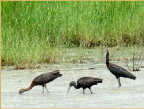
A flock of busily feeding Glossy Ibis