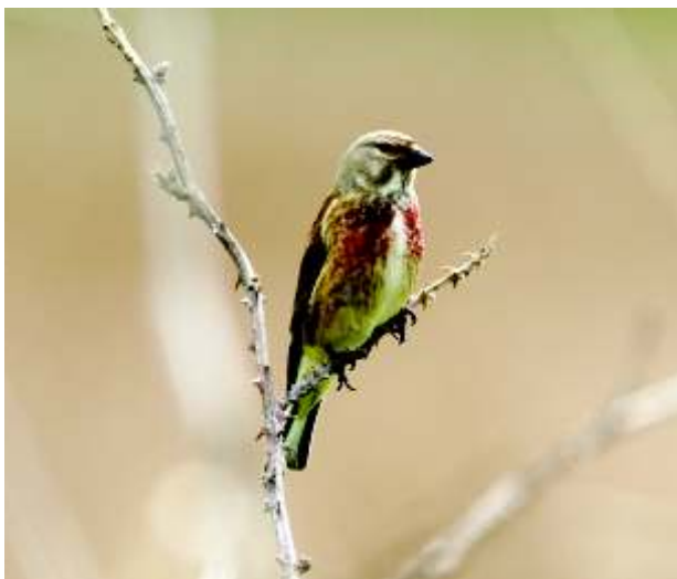
Eurasian Linnet Carduelis cannabina