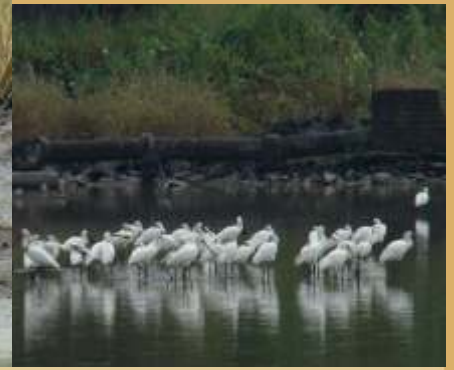
Large flocks of Spoonbill such as these were common in Uran

Both Black-headed Ibis Threskiornis melanocephalus and Glossy Ibis Plegadis falcinellus used to be seen here. The greenish-bronze sheen of the Glossy Ibis was an admirable sight as they moved about in the marsh in great numbers in a feeding frenzy. They always seemed too busy stuffing themselves to be bothered about onlookers like us. However the moment you tried to venture a little closer to them, they bobbed up their heads and took off in unison, only to settle down at the nearby marsh to resume their feast. Black-headed Ibis were relatively easier to approach and bolder than the Glossy ones. Gulls and terns congregated in thousands here each season with Black-headed Gull Larus ichthyaetus , Brown-headed Gull Larus brunnicephalus , Heuglin's Gull Larus heuglini , Common Tern Sterna hirundo , Whiskered Tern Chlidonias hybridus , Gull-billed Tern Gelochelidon nilotica , Caspian Tern Sterna caspia completing this assortment. There have been moments when the sky above me was suddenly overcast by a cloud of gulls appearing out of thin air to settle down, and the same pattern being repeated by a flock of terns following them. After settling down, the Caspian Tern, being taller and larger in size than the others, easily stood out in this crowd.