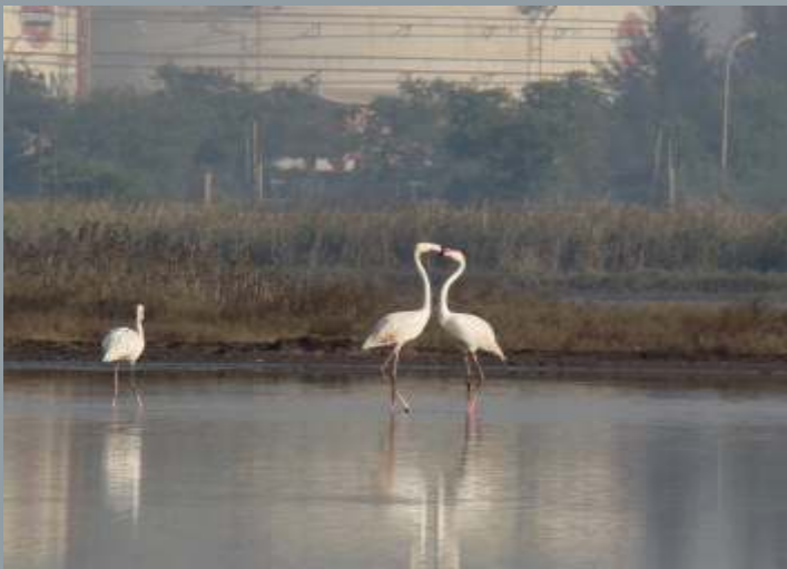
Greater Flamingos engaged in a fight, which looks like a round of fencing with their bills