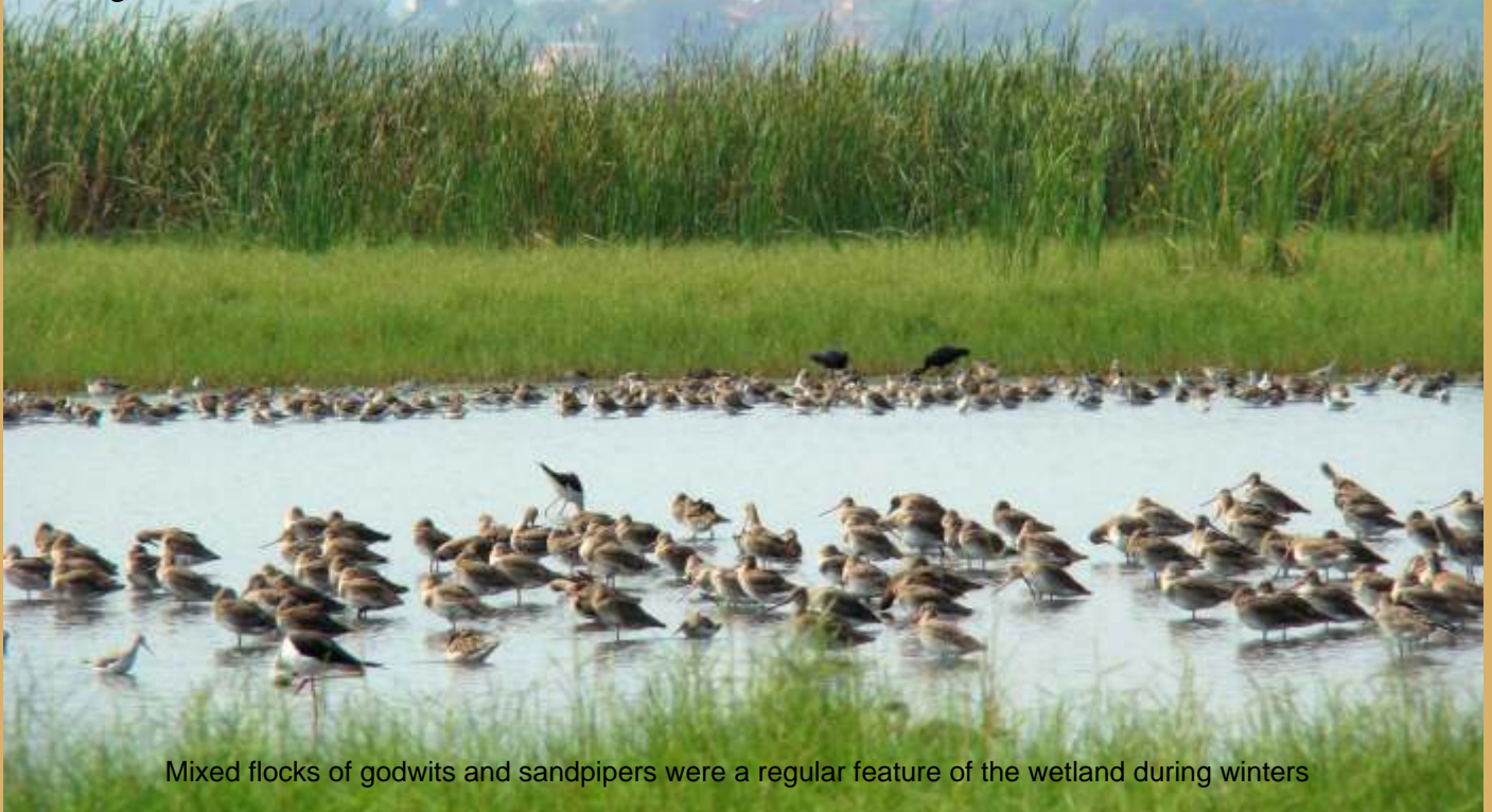
Mixed flocks of godwits and sandpipers were a regular feature of the wetland during winters

Mumbai region records about 44 species of shorebirds, of which nearly half could be found in the wetlands of Uran alone. Shorebirds are known to exhibit site-fidelity, i.e., they return to the same site year after year during winter.