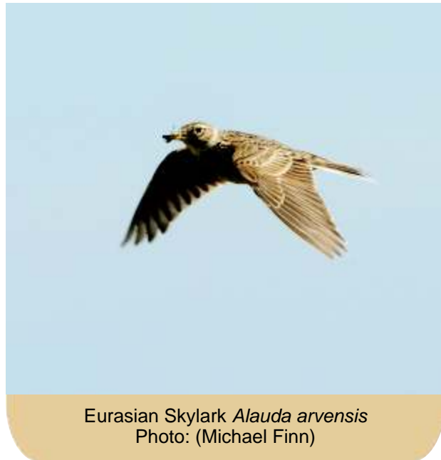
Eurasian Skylark Alauda arvensis

The Pan-European Common Bird Monitoring Scheme has compiled population figures for 145 common and widespread bird species in 25 European countries between 1980 and 2009. Amongst those species covered, farmland birds were found to be the most threatened group, with 20 out of 36 species in decline, and their overall numbers at an all-time low, down by 48% since 1980. Some of the species that have declined the most over the last three decades include familiar farmland birds like Grey Partridge Perdix perdix (-82%), Skylark Alauda arvensis (-46%), Linnet Carduelis cannabina (-62%) and Corn Bunting Miliaria calandra (-66%).